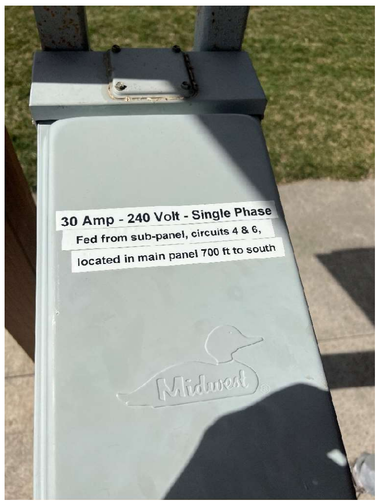
Description of available electric at "North Location"