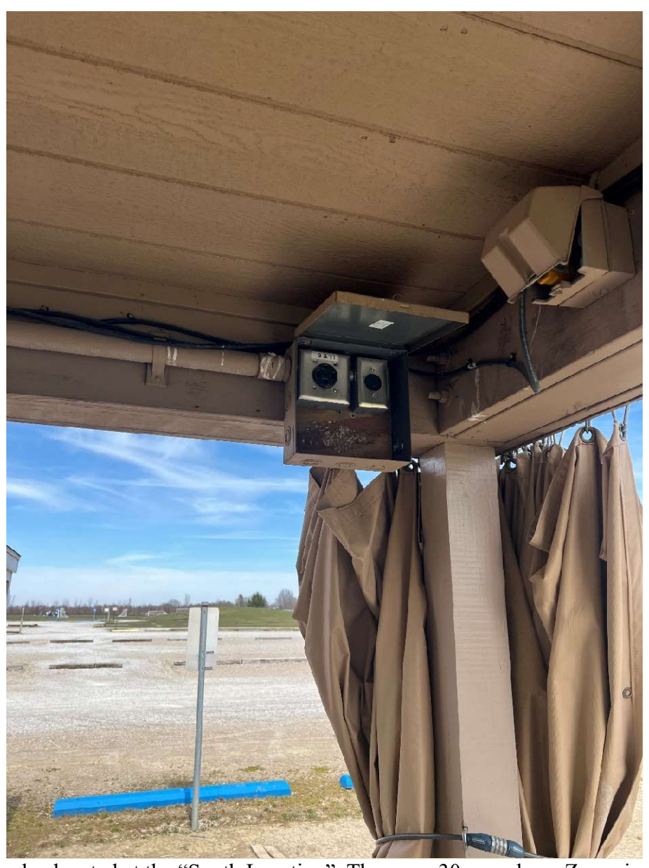
This is also located at the "South Location". These are 30amp plugs. Zoom in on the image to see it better.