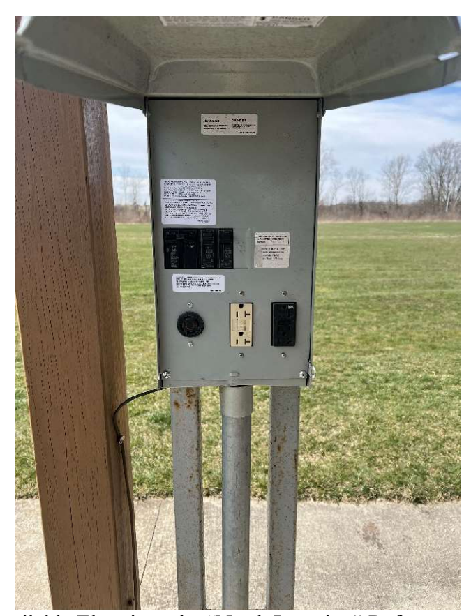
Available Electric at the "North Location" Refer to map.